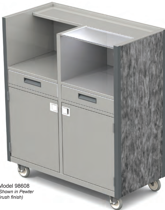
Model 98608 (Shown in Pewter Brush finish)